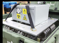
WIRE ROPE ISOLATOR MOUNT