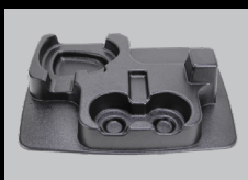
THERMOFORMED PLASTIC INSERTS