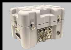
EMI SHIELDING OPTIONS