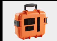
CUSTOM ROUTING AND CUTOUTS