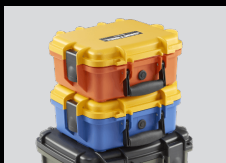
STANDARD / CUSTOM COLORS