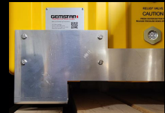
FORKLIFT BASH PLATES