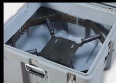
ELASTOMERIC ISOLATOR MOUNT