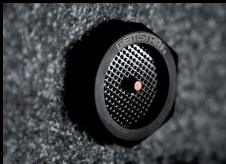
PRESSURE RELIEF VALVES

Modification. Customization. Adaptation. Whatever you call it, we've built our reputation on our unique ability to tailor our cases to the specific needs of your project. We offer 150+ standard sizes that can be customized to meet your requirements. You need CNC routing and deck mounts? We can do that. Dual layers and special resins? We can do that, too. Plus we offer a robust selection of custom features, sizes, and colors to add purpose-built functionality to any case. Built to the toughest standards. Tailored to your specific needs. That's how we roll.