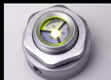
ELECTRONIC HUMIDITY SENSOR

Get your next project started at GemstarMFG.com or through one of our technical distributor partners.