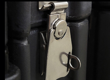
LOCKABLE PADLOCK HASPS