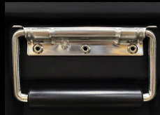
STAINLESS STEEL HARDWARE