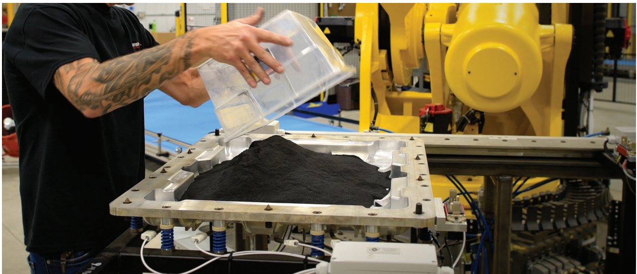
Robomold allows for the use of innovative resins.

Today, the production of specialized parts and protective hard cases for the nation's military calls for unique materials and processes that meet more stringent standards (flammability, high heat/cold tolerances, airtightness, watertightness, EMI shielding, multi-layering, etc.). Meeting these strict requirements can be challenging when using traditional molding processes such as rotational molding, thermoforming, blow molding, or injection molding.